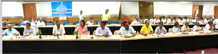
TAMILNADU CIRCLE PENSION ADALAT ON 16-5-2018