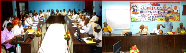
CHENNAI CWC MEETING : 16-17, APRIL 2018