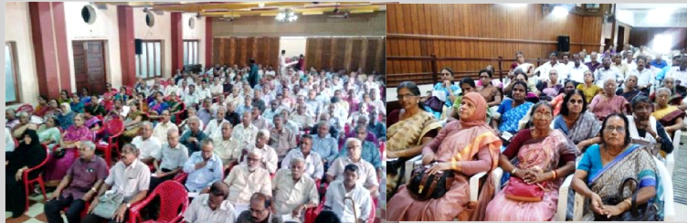
CALICUT DIST. CONFERENCE