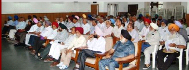
PUNJAB CIRCLE CONFERENCE: 4-4-2018