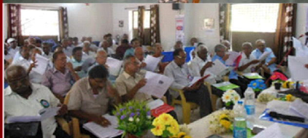
AP CEC MEETING AT ANANTHAPUR: 23-5-2018