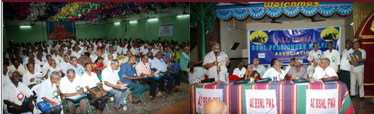
FORMATION CONFERENCE : TAMBARAM 20-8-2009