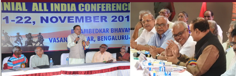
BANGALORE AIC: 21-22, NOVEMBER 2015