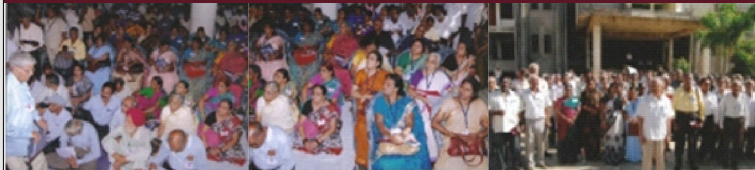
JAIPUR CONFERENCE : 5 - 6, OCTOBER, 2012