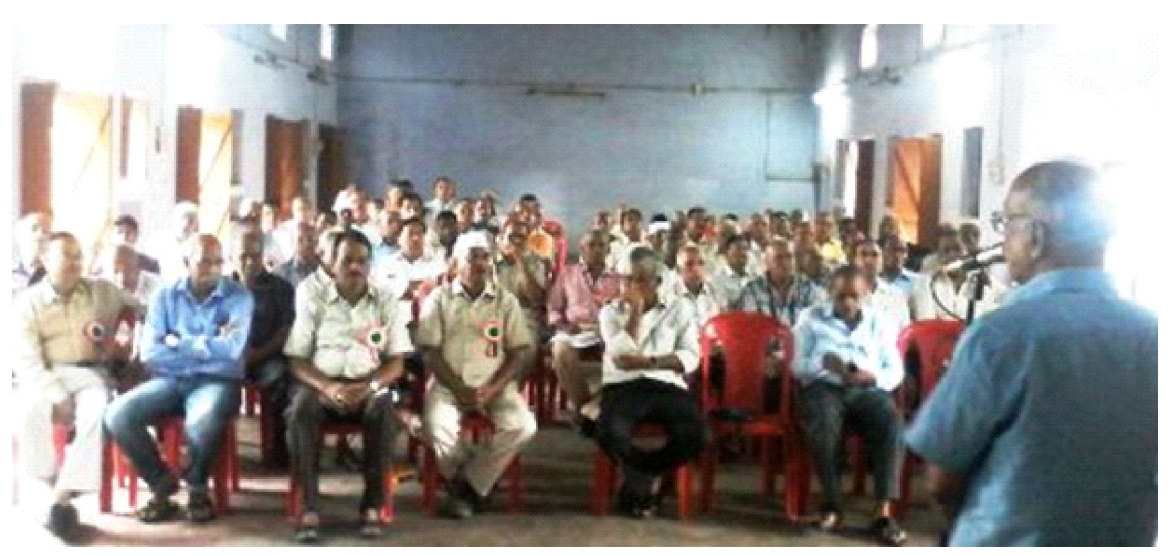
MADHYAPRADESH CIRCLE CONFERENCE