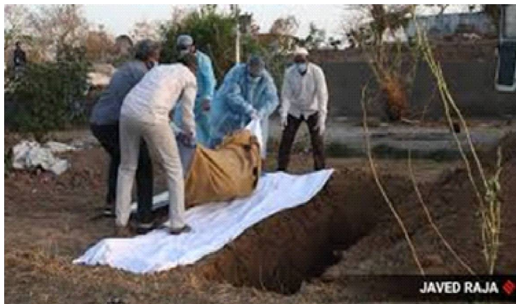
A DEAD BODY IS CREMATED IN MUMBAI

COVID CASES: 178 LAKHS COVID DEATHS: 7 LAKHS