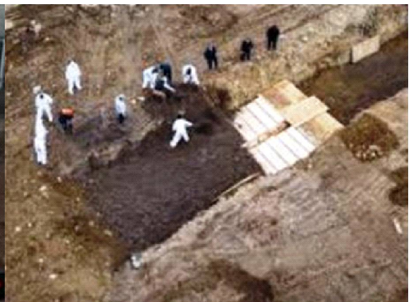
UNCLAIMED BODIES IN KARNATAKA