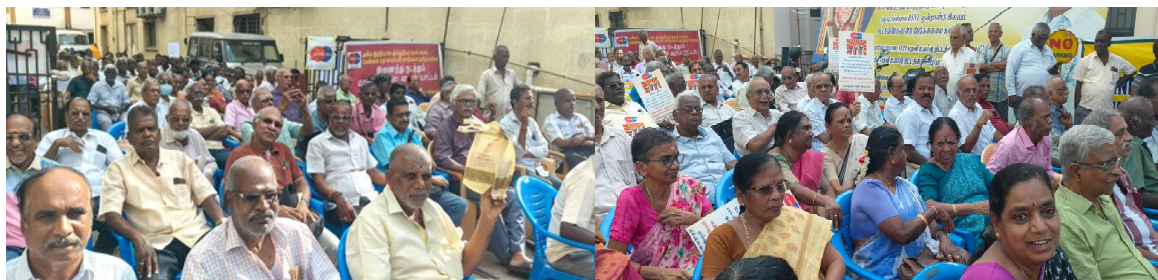
TAMILNADU & CHENNAI