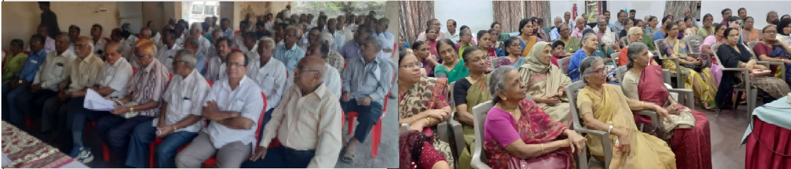
Tumkur Dist conference on 8-2-25