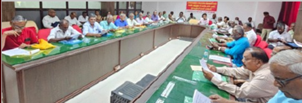
Tamil Nadu - CEC meeting