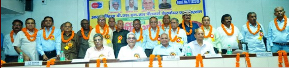
UP West Circle Conference