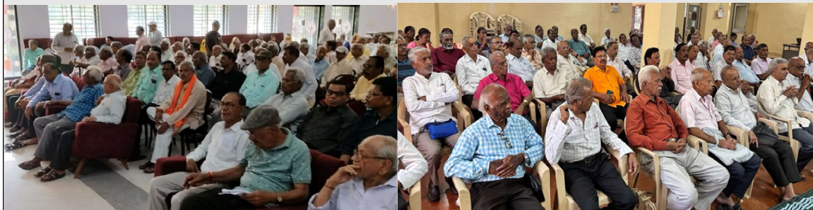
Jabalpur Dist conference