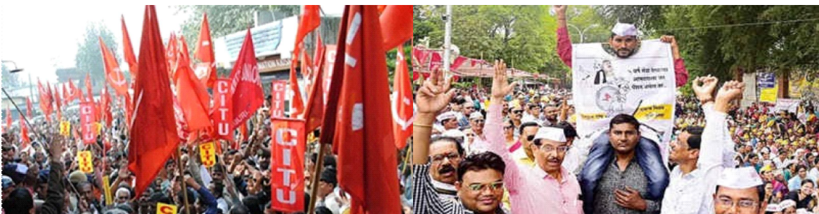
PROTEST BY CITU