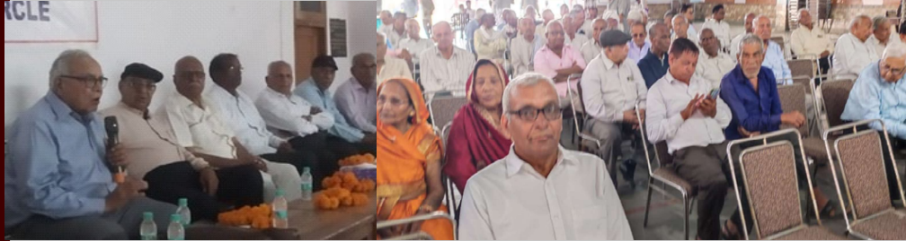
Haryana Circle Conference