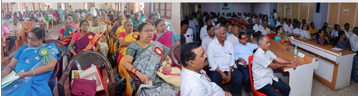
Thanjavur Dist conference