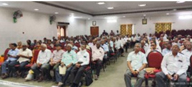
VIJAYAWADA GENERAL BODY