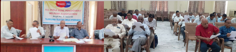
Telanganana - CEC meeting