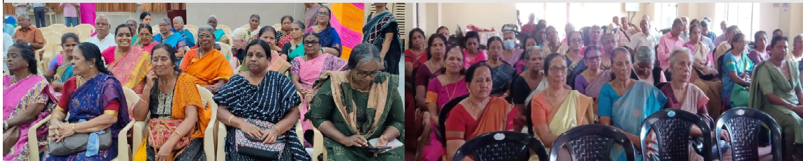
Womens Day by Chennai Tfc. Br.